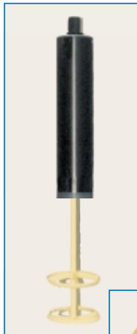
Faired Acoustic Sensor